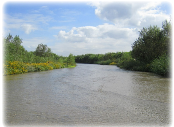
Santa Ana River

All groundwater-quality data are checked by Watermaster staff and uploaded to a centralized database management system that can be accessed online through HydroDaVE SM . Groundwater-quality data are used by Watermaster for: the biennial State of the Basin report; the triennial ambient water quality update mandated by the Basin Plan; and the demonstration of Hydraulic Control—a maximum benefit commitment in the Basin Plan. Data are also used for monitoring nonpoint source groundwater contamination and plumes associated with point source discharges and to assess the overall health of the groundwater basin. Groundwater-quality data are also used in conjunction with numerical models to assist Watermaster and other parties in evaluating proposed groundwater remediation strategies.