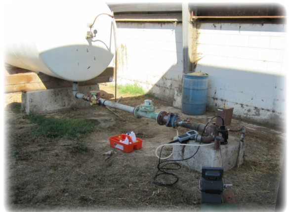
Groundwater Quality Sampling

In July 2005, the RWQCB prepared draft Cleanup and Abatement Orders (CAOs) for six parties who were tenants on the Ontario International Airport (OIA) with regard to the Archibald South (trichloroethene [TCE]) Plume. The draft CAOs required the parties to “submit a work plan and time schedule to further define the lateral and vertical extent of the TCE and related VOCs that are discharging, have been discharged, or threaten to be discharged from the site” and to “submit a detailed remedial action plan, including an implementation schedule, to cleanup or abate the effects of the TCE and related VOCs.” Four of the parties (Aerojet, Boeing, General Electric [GE], and Lockheed Martin) voluntarily formed a group (known as ABGL) to work jointly on a remedial investigation. Northrop Grumman declined to participate in the group. The US Air Force, in cooperation with the US Army Corps of Engineers, funded the installation of one of the four clusters of monitoring wells installed by ABGL.